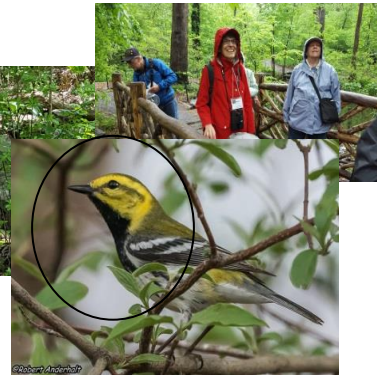
You never know what you might see while